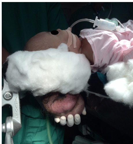
Fig. (2). Showing one baby intubated on the adjustable horseshoe headrest.

Breathing circuit was filled with 8% sevoflurane with 100% oxygen. The difficult airway cart was kept readied and immediately available. Once the baby was brought to the operating table, the patient's head was adjusted so that the encephalocele was free of pressure in the adjustable horseshoe headrest. One assistant from the lateral side supported the mass by his one hand and another hand was kept free for external laryngeal manipulation if required. The prefilled circuit attached with mask was held and simultaneously SpO 2 and other monitoring were put. The head rest was adjusted to make the external auditory meatus and sternum at the same horizontal level. Further drugs were given once mask ventilation was possible however no muscle relaxants were used. All cases were induced in similar ways and intubated while preserving the spontaneous ventilation. All the four babies positioned with the help of horseshoe were intubated successfully using Miller blade 1 and appropriate sized uncuffed endotracheal tubes. The maximum attempt required to intubate was 3 (three) in one of the case. The demographic parameters of all the babies are presented in Table 1. The mean number of attempts and Cormack-Lehane views are shown in the Table 2.