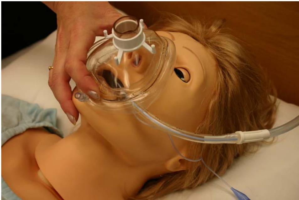
Figs. (2). A transparent air-cushioned face mask (Westmed®) is applied while bending the endotracheal tube down the left side of the face and manual oxygen-bag-mask ventilation started (Fig. 2).

ful endotracheal intubation, the esophageal tube is removed and replaced with a nasogastric tube.