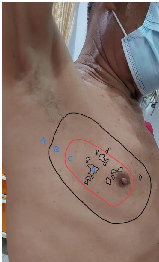
Fig. (1). The distribution of lesion and expected pain of the patient's right chest region, (A) Unaffected area; (B) Allodynia and hyperalgesia area; (C) Spontaneous pain area; (D) Cutaneous scar area with hypo-pigmented lesion.

areola without any redness and edema, as presented in Fig. (1). No sensory deficits were recorded during previous admission to a neurologist. The routine hematologic checkup was within normal range, leading to the diagnosis of Post-herpetic Neuralgia (PHN). Furthermore, TPVB was performed 3 times at the Th3 to Th5 level of the vertebra after providing an explanation and obtaining informed consent. Based on Ultrasonography (USG) procedures, levobupivacaine 0.25% (Levica®) and dexamethasone 10 mg in 5 ml solution were injected at each vertebra level after being induced by stimuflex® ultra 360® needles in the plane to the respective paravertebral spaces (Fig. 2).